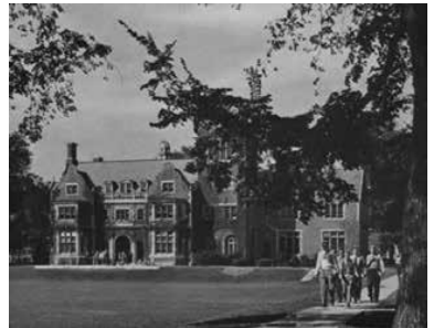
Coxe Hall, ca. 1942