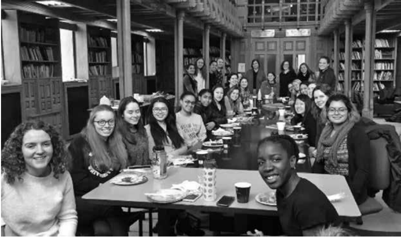
HWS PLEN Meeting in the Elizabeth Blackwell Room