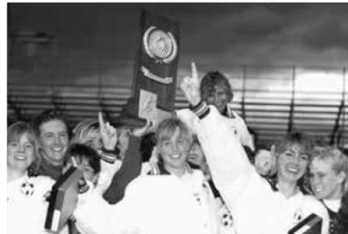
1988 Soccer NCAA Champions