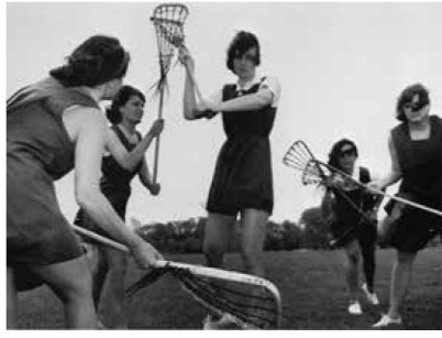
William Smith lacrosse, 1965