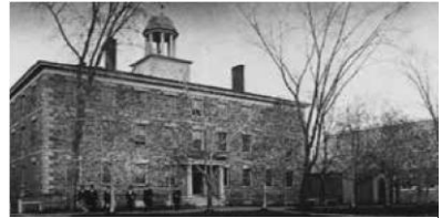
Geneva Hall and St. John's Chapel - late 1800s

Hobart and William Smith Campus Expansions - listed in order of acquisition or renovation.