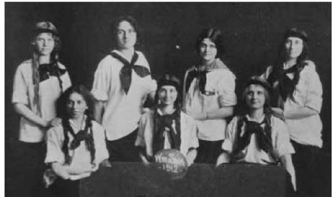
WS Basketball Team, 1912

The College offers 12 varsity sports: basketball, cross country, field hockey, golf, ice hockey, lacrosse, rowing, sailing, squash, soccer, swimming and diving, and tennis. Coaches welcome and encourage multi-sport participation.