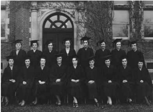
William Smith Class of 1932

The Commencement exercises begin with a procession to the Quad led by bagpipers, followed by the President, Provost, Honorary Degree recipients, Trustees faculty and students. The program includes addresses given by a Commencement speaker, a Hobart senior speaker, and a William Smith senior speaker.