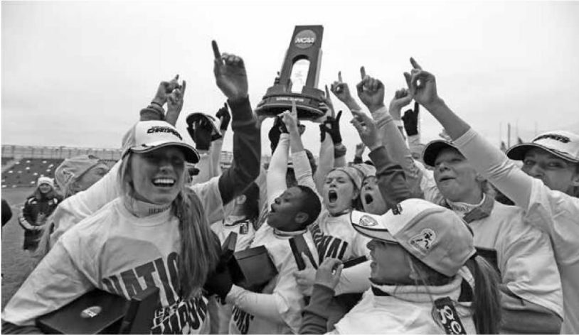
The Herons celebrating their 2013 NCAA Soccer Championship