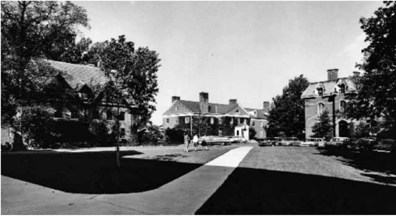
Miller, Blackwell, and Comstock dormitories pre-1960

Blackwell House , 1863, is located on the Hill and currently houses 32 William Smith students. Named to honor Dr. Elizabeth Blackwell, it was the first William Smith residence hall.