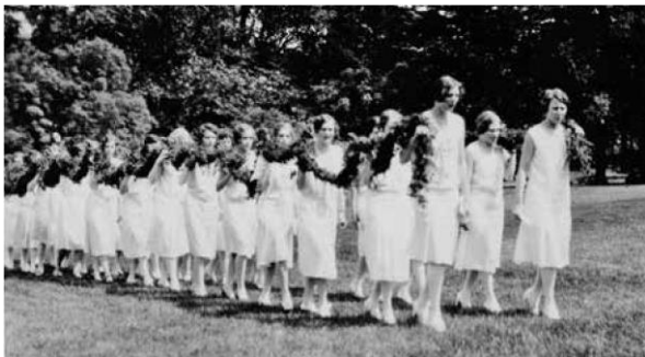
Moving Up Day, 1930

Commencement week program and the end of the academic year. Activities include Moving Up Day and Wednesday Class Night on the Hill, when the Classes gather for dinner and to sing class songs.