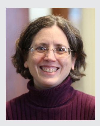
TIP: Take the time to find your passion and don't feel you have to know what your life goal is by graduation.