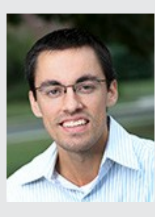
TIP: Avoid tunnel vision: step outside your comfort zone and take a breadth of classes. Now is the time to wrestle with new ideas.