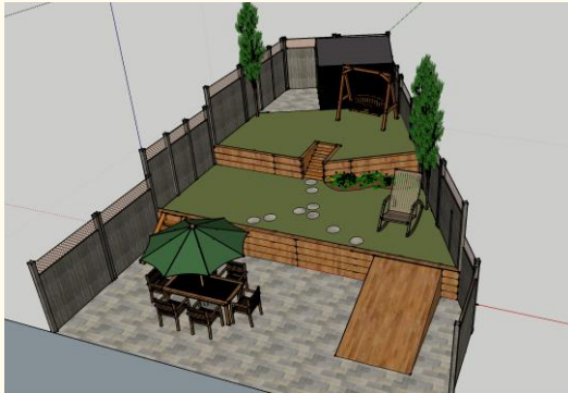
3-D design of a respite care garden