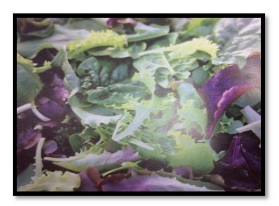
Some vegetables that can be grown in your cold frame. { Coleman, Eliot. Four-season Harvest: Organic Vegetables from Your Home Garden All Year around. White River Junction, VT: Chelsea Green Pub., 1999. Print}