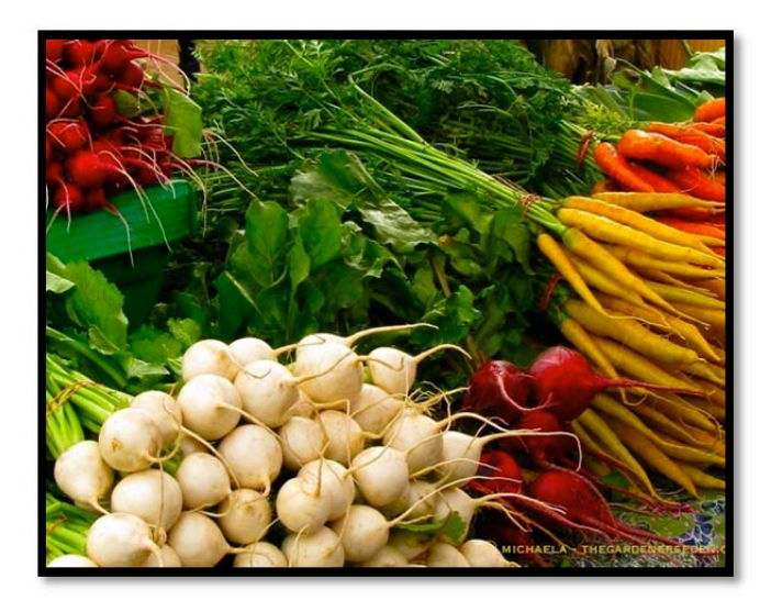
Salad greens and root vegetables are two traditional choices for growing in a cold frame because of their cold hardiness. {Lively, Ruth, and Eliot Coleman. "Cold Frame Gardening." - Vegetable Gardener. Aug. 1996. <a href="http://www.vegetablegardener.com/item/2504/cold-frame-gardening/page/all">http://www.vegetablegardener.com/item/2504/cold-frame-gardening/page/all</a>; {thegardenerseden.com}